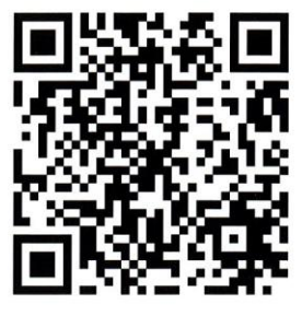
Head to YouTube!